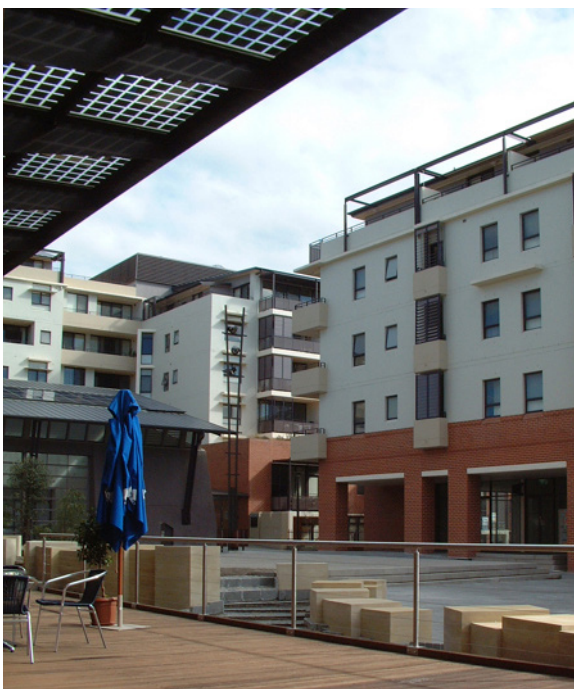
view of square