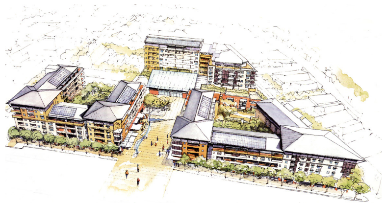
Artist's aerial perspective (Allen Jack and Cottier)