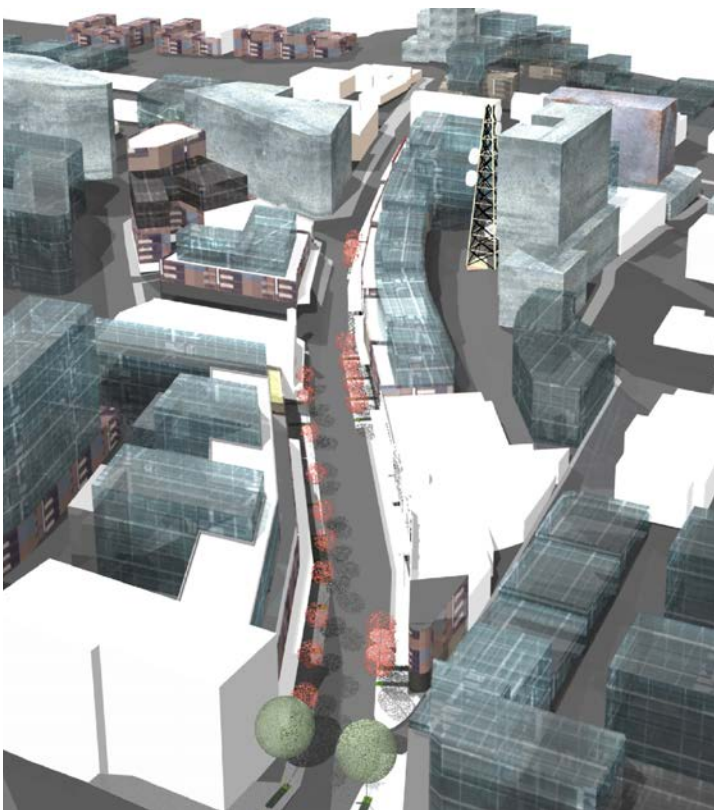
view down crown street

Olsson & Associates led the planning team by preparing detailed urban design principles, building envelopes and site densities for economic analysis and as a framework for public domain design.