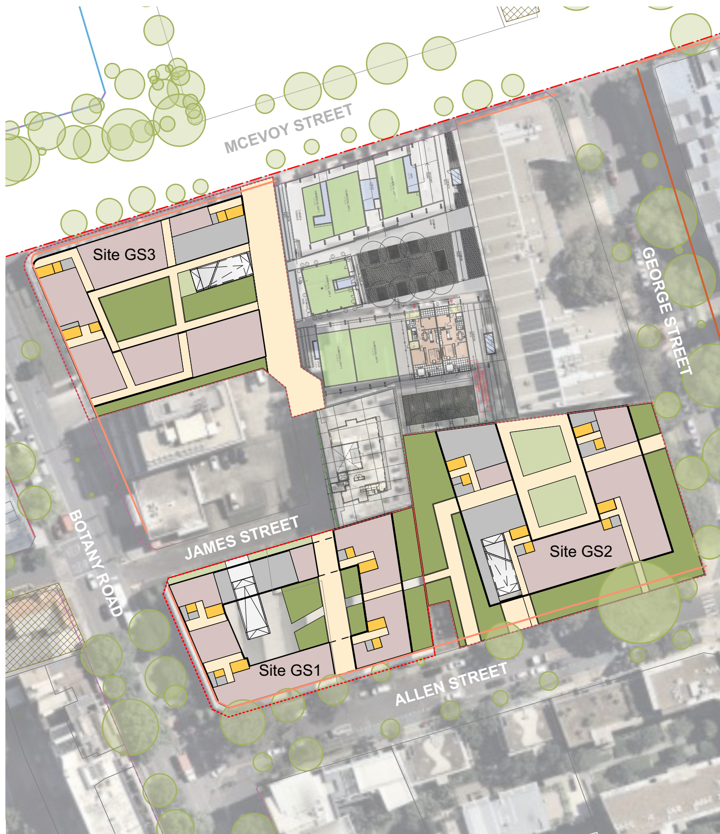
George Street Sites: Ground Floor Plan 1:1000